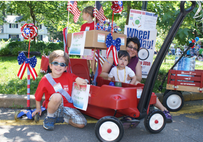
THE WHEEL DAY PARADE ON MEMORIAL DAY WEEKEND.