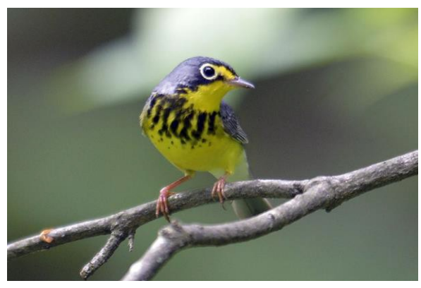
Canada Warbler

The Canada warbler spends the winter (nonbreeding season) in northern Southern America (blue areas on map). There are important habitats in Colombia and Venezuela. The yellow areas on the map are areas of importance as stopover sites. These are sites that birds use to refuel and rest so that they can continue their journey. Monticello Park is one of those sites. Breeding areas (red on map) are primarily in Canada. The Canada warbler makes this epic journey twice every year.