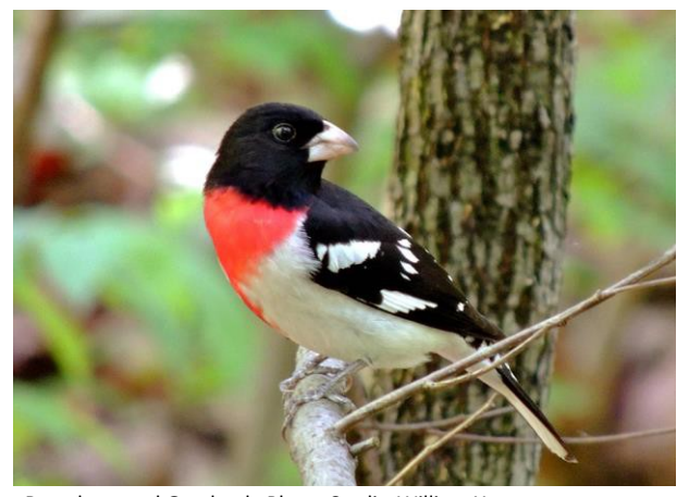
Rose-breasted Grosbeak

During the pandemic, the U.S. has seen an increase in the use of and visits to parks and green space and an increase in sales of bikes, camping equipment, binoculars and more. With increased use comes increased impacts, so it is important to recreate responsibly and respect the resources of our parks.